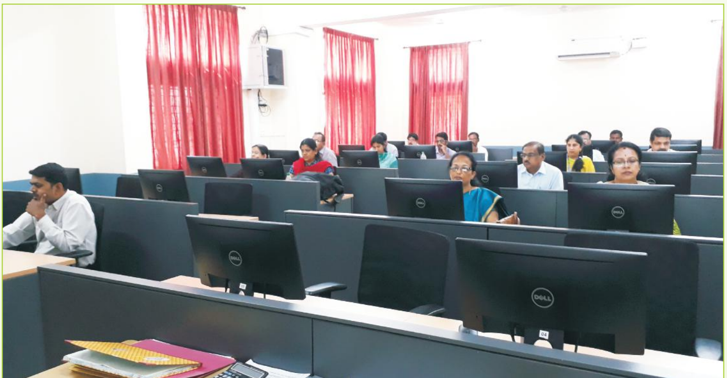
Digital Evaluation Hall